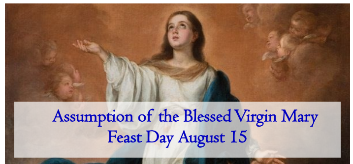
Assumption of the Blessed Virgin Mary Feast Day August 15

La oficina parroquial estará cerrada Martes, Jueves